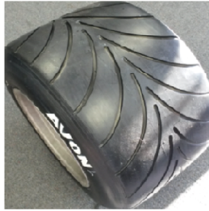
Pattern Avon Intermediate