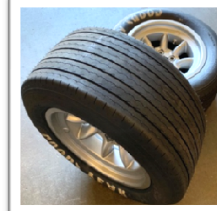
Pattern Straight Cut Grooves

Below are the Avon Tread Patterns from Avon.