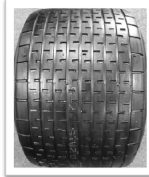
Pattern Historic Wet