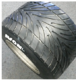
Pattern Avon Full Wet