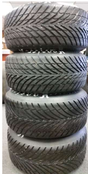
Wet Pattern Hoosier's Hand Cut