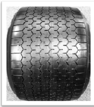
Pattern Historic Old