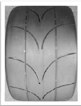
Pattern Dry Intermediate