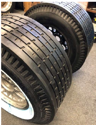
Hot Rod Pattern Drag Slicks Hand Cut