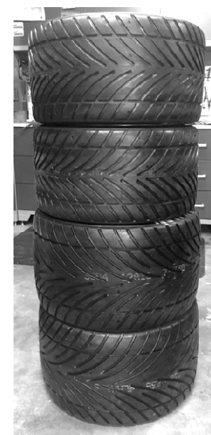
Avon Wet Pattern Avon's Hand Cut